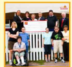
CIBC Cheque Presentation