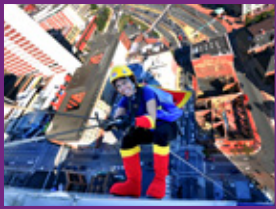
Debby Chipman is superwoman at the Drop Zone

Experiencing the Zones! September 18 and October 3