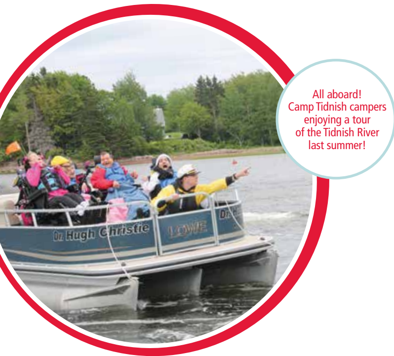
All aboard! Camp Tidnish campers enjoying a tour of the Tidnish River last summer!

Easter Seals Nova Scotia serves as a community resource for polio survivors in our province. There are 187 people who belong to Polio Nova Scotia, and we help produce and distribute its newsletter to members. In the 1930s, Easter Seals was instrumental in providing assistance and expertise for those Canadians – and their families – affected by a polio outbreak. Post-polio survivors continue to rely on Easter Seals Nova Scotia for information and resources.