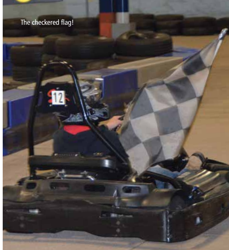
The checkered flag!