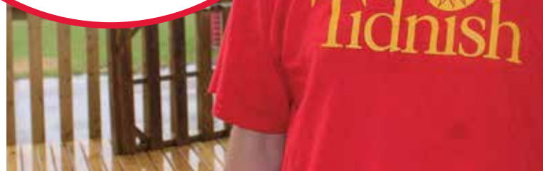
Matt Walsh – former Camp Tidnish camper, and in 2015, camp counsellor