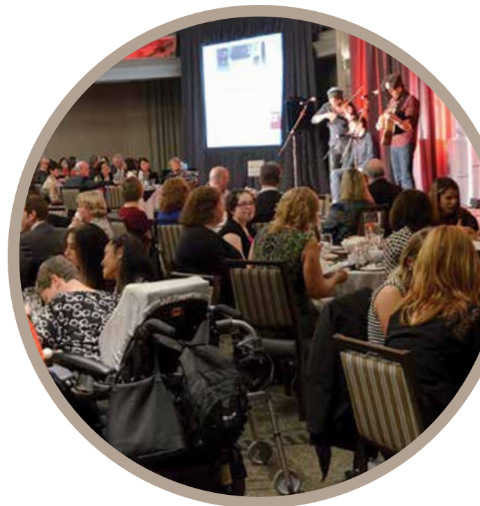
Ten Strings And A Goat Skin onstage!