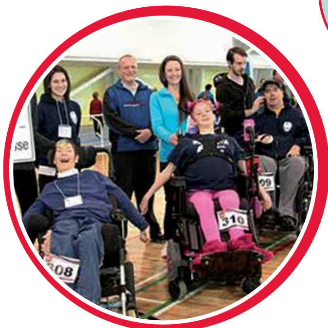
Team Nova Scotia at the 2015 National Boccia Championships in Whitby, Ontario.

Our Take Part programs are designed to create opportunities for Nova Scotians with disabilities to participate in sports and active living.