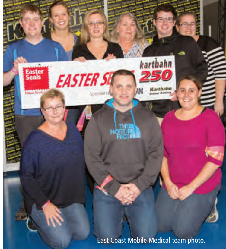
East Coast Mobile Medical team photo.

Easter Seals partnered with the California Wine Institute and the Society for American Wines to host the California Wine Fair on April 14, 2016 at Pier 21.