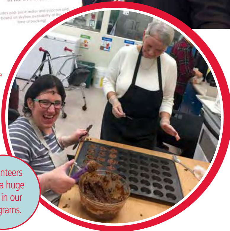
Volunteers play a huge part in our programs.