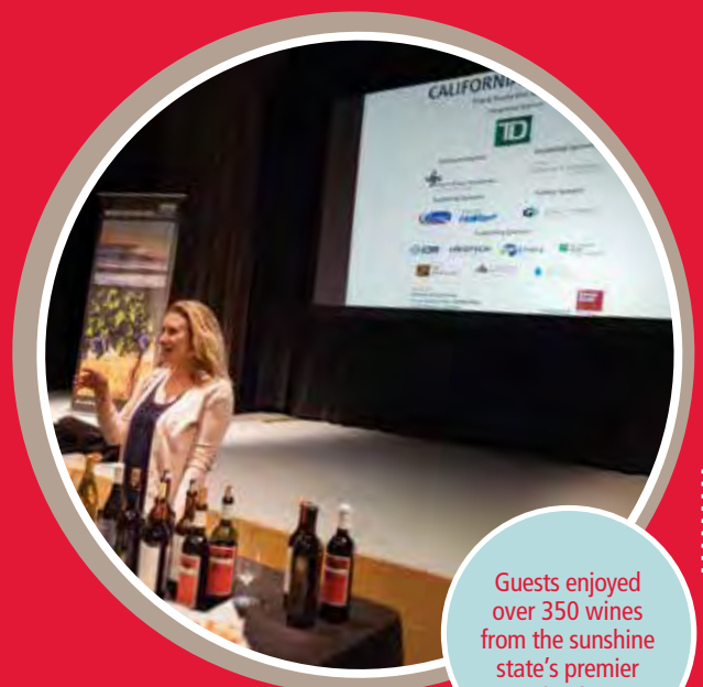
Guests enjoyed over 350 wines from the sunshine state's premier wineries.

Easter Seals Nova Scotia partnered with the California Wine Institute and the Society for American Wines to host the California Wine Fair on April 5, 2017 at Pier 21. Enjoyed by over 400 guests, the event and silent auction raised over $65,000 to support the programs offered at Easter Seals Nova Scotia.