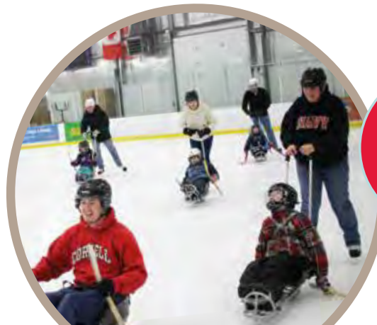
Volunteers assist with the weekly Learn to Sledge Hockey Program