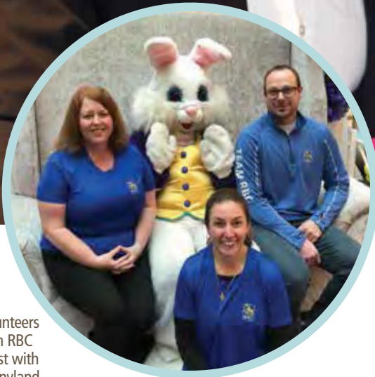
Volunteers from RBC assist with Bunnyland.